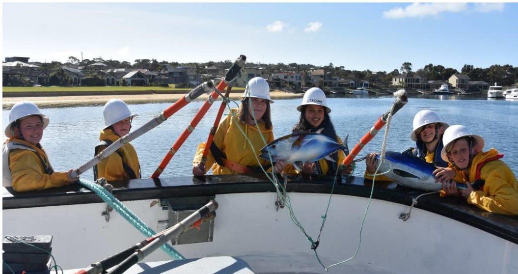
Port Lincoln students participating in a Blue Fin Day on the MFV Tacoma