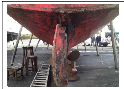
DOLPHIN at Beachport, July 2014