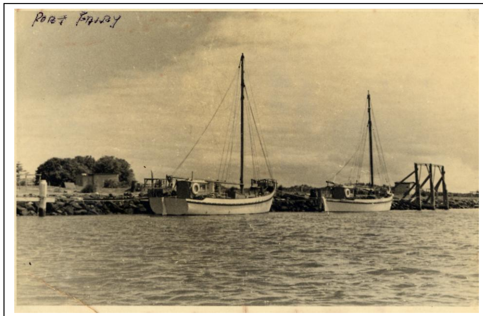
DOLPHIN and AMARYLLIS at Port Fairy