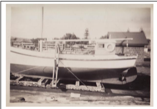
DOLPHIN on the slip. NOTE Rudder.

For example, an on board activity might include catching fake sharks/rock lobsters. A gourmet experience linking fish with fine food.