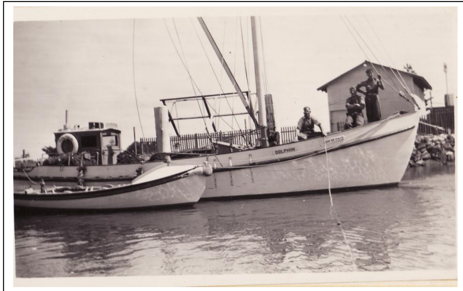
DOLPHIN at Port Fairy