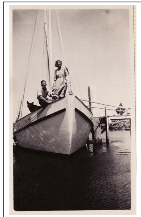
DOLPHIN at Port Fairy, Bow on shot.