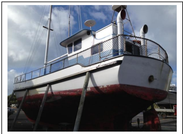
DOLPHIN at Beachport, July 2013