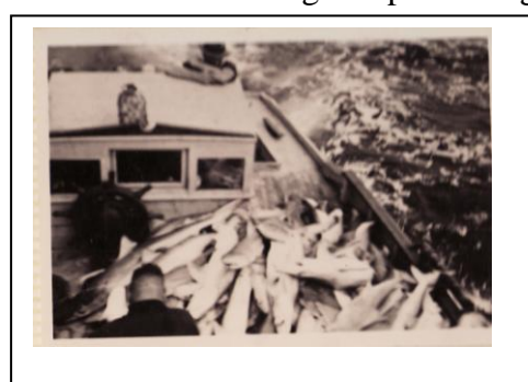
Lowering engine on DOLPHIN, and DOLPHIN with a catch of shark