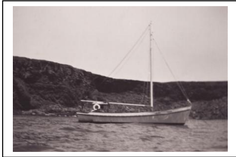
DOLPHIN at Julie Percy Island.

The stern has a self draying cockpit ideal for cuta fishing and DOLPHIN was the first Victorian fishing vessel to fit a wheel house for crew protection