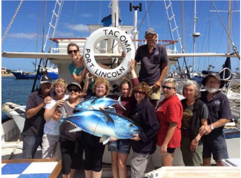
Zephyr in Port Lincoln (date unknown)

Group photo of first all-female crew in 2014. The sixth trip with Claire as 'Deck boss' will be in 2020.