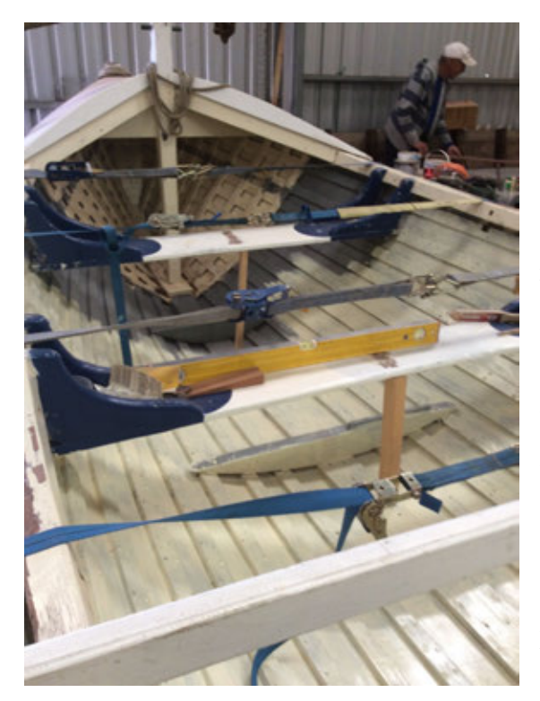
Tension straps hold the hull firmly in place

The hull of the surfboat has been scraped bare of paint and every rivet removed from the thirty-seven cracked ribs. The total number of ribs in the boat is fifty-two. The inside of the boat has been primed.