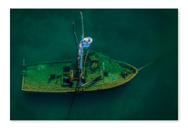
The Almonta as she looks today.

There has been a call to Save the Almonta. She sank off Snooks Landing more than a year ago and is now resting on the bottom. The Almonta was an early wooden vessel in the local salmon and bluefin tuna fleets.